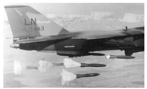
Fig. 4. Ballute inflation during munition release at high speed.

Ballutes are very widely used in personal parachutes and to decelerate weapons dropped from high-speed aircraft. Fig. 4