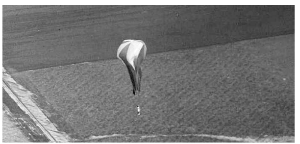
Fig. 6. Falling and inflating. Note systems canister below mouth of ballute.