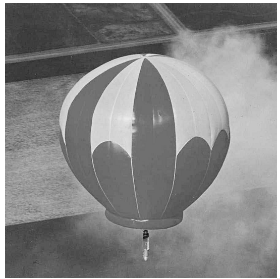
Fig. 7. Ballute fully inflated, heated & flying level.

The author easily stopped a 15,000 meter terminal [burner off] descent in a hot air balloon in 200 meters, Fig. 8. Indeed stopping a descent is so easy that every student is now required to make a terminal descent in training to receiving a balloon pilot license.