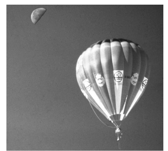
Fig. 8. The author easily stopped the terminal descent of this balloon after falling 15,000 meters.

cooled to 90K is conceivable, but would be a major facility. By contrast a simple static chamber cooled to near the boiling point of nitrogen provides an excellent facility to simulate static inflation under a ballute.